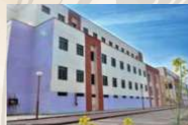
The ICFAI University, Himachal Pradesh (Baddi)