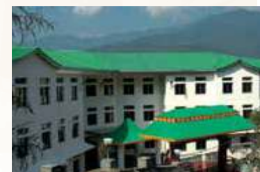
The ICFAI University, Sikkim