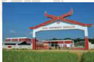
The ICFAI University, Nagaland