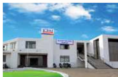
The ICFAI University, Jharkhand