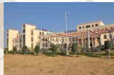
The ICFAI University, Jaipur