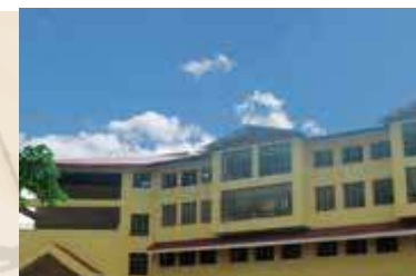
The ICFAI University, Meghalaya