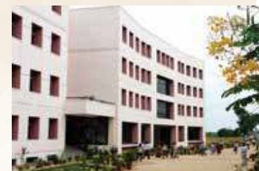
The ICFAI University, Tripura