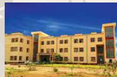
The ICFAI University, Raipur