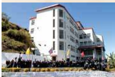
The ICFAI University, Mizoram