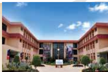
The ICFAI University, Dehradun